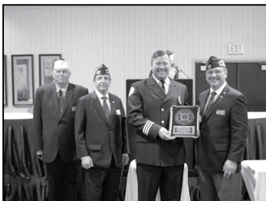
Many District, Post, and members receive recognition for their outstanding achievements.