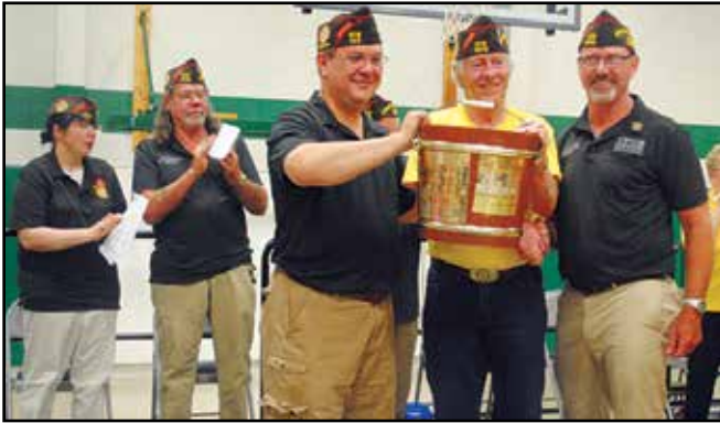
Every year there is a “competition” between Ohio and Michigan as to which Department can raise the most money for the VFW National Home. The highest donor takes home the Wooden Bucket for the year. This year was record setting!! Ohio donated $48,000 on Saturday. Michigan donated $52,000 on Sunday! Michigan VFW gets to take home the Wooden Bucket, but the big winners are the residents of the National Home!! $100,000 donated in two days!!!