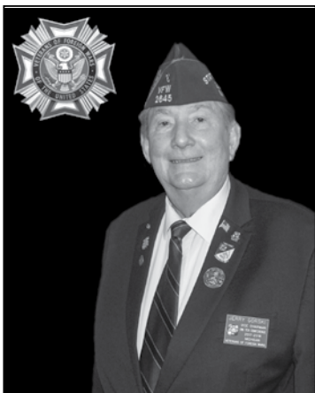
Veterans of Foreign Wars 2019-2023

Department of Michigan National Council of Administration 2019-2023